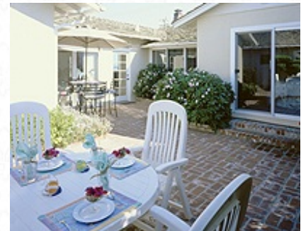
FRONT & BACK PATIOS